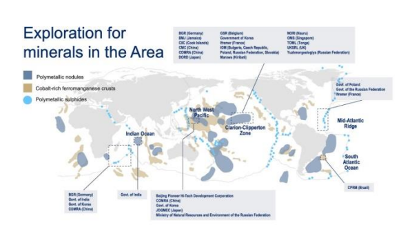
Figure 1: Mineral Exploration Map and Deep Seabed

There is an increasing interest in the mining of the deep seabed mineral deposits due to exhausting terrestrial mineral deposits of high-value metals such as cobalt. lithium, zinc. manganese, aluminium, nickel, and copper, which are very important to produce different electronic products like smartphones, wind turbines, solar panels, and batteries. The extraction and often excavation of mineral deposits from the deep seabed, where ocean water depths greater than 200 m, could severely harm marine biodiversity and ecosystems. As of May 2022, the International Seabed Authority (ISA) had issued 31 contracts to explore deep-sea mineral deposits, collectively covering the international seabed of more than 1.5 million km2 (Figure 1). However, the ISA has only issued exploration contracts so far, but not the exploitation contract yet. The ISA's regulations for exploiting the sea minerals deposits are currently under development as some countries have already shown their strong intention to start deep-sea mining. Based on the available information, it is assumed that deep seabed mining could commence as soon as 2026 in international waters.